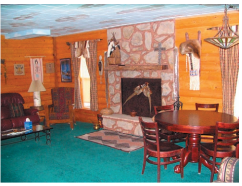
WiFi Available throughout the Lonesome Dove

Accommodations in the Boardin' House (above) include private room with bath.