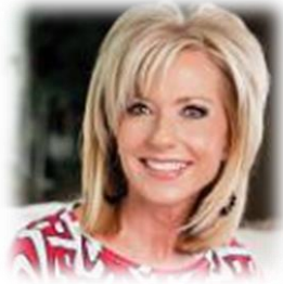
Beth Moore Speaker

Beth Moore is a speaker and author of best-selling Bible